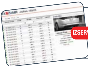
IZSERVER FOR SYMMETRY™ SOFTWARE