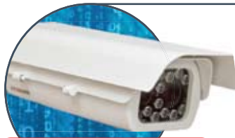
ALL-IN-ONE ALPR CAMERA SYSTEM