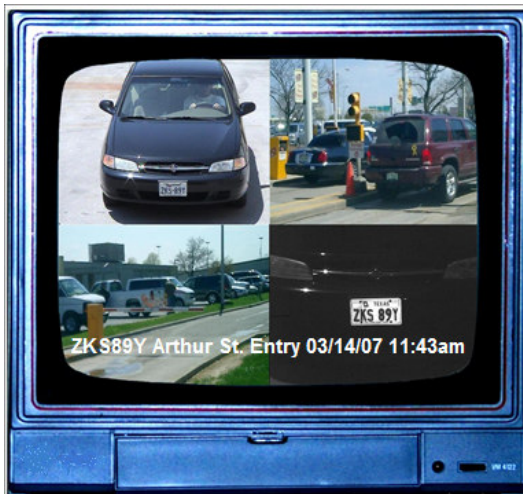
Typical search result display showing license plate image and information overlay

DVR integration with InSignia™ provides the security advantage of knowing when a particular vehicle enters your facility.